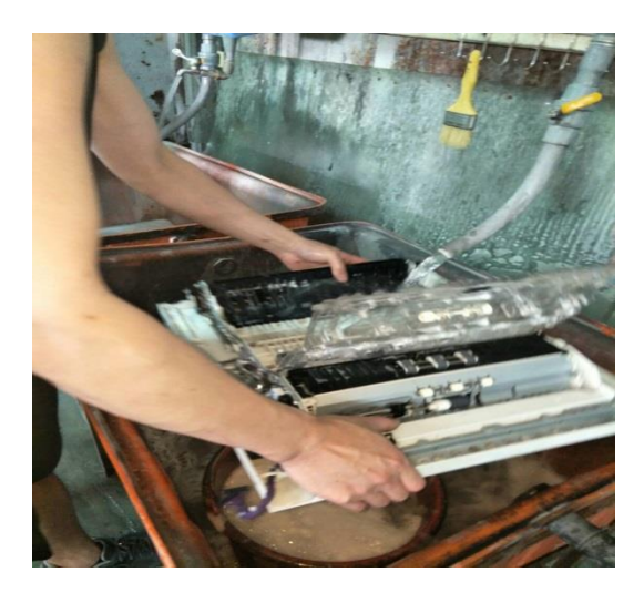
Fig. 6 Repaired the laser exposure group