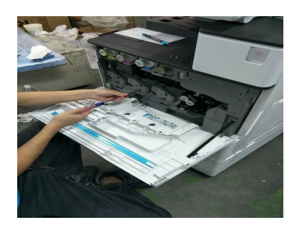
Fig. 5 Detecting the polygon mirror motor of the laser exposure group