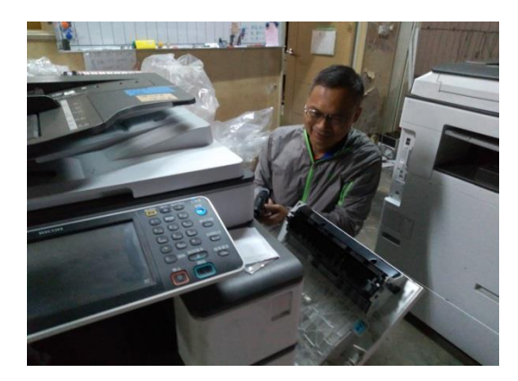
Fig. 4.Detecting the asymmetric motor of the laser exposure group