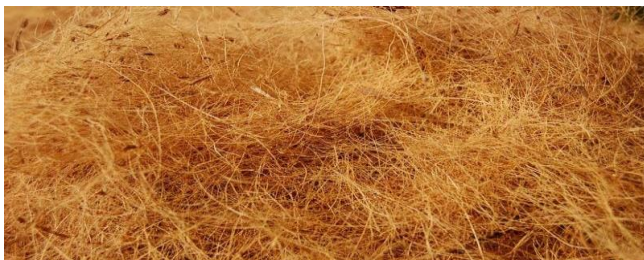
Figure 3: Extracted coir fiber

To separate the fibers, the husks are beaten on tree trunks or stones with wooden mallets. The fibers are cleaned, dried, and formed into stacks. The soaked husks are fed into breaker drums with spikes to extract the brittle fiber. To separate the long and short fibers, the drums are driven at high speeds in opposite directions. The brittle fibers that pass between the drums are collected and cleaned by passing them through another pair of drums with closer nails, after which the fibers are washed and dried.