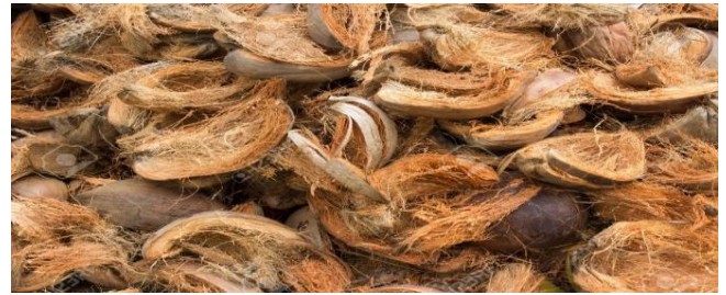
Figure 2: Coconut husks

Fibers are natural or synthetic hair-like materials that come in continuous filaments or discontinuous elongate sections comparable to thread (Vignesh S et al., 2019). Mineral fiber, Plant fiber, and Animal fiber are the classifications of natural fiber. Minerals having fibrous crystal habit are abundant in the Earth's crust, the most important is commercial fibers from the asbestos family; chrysotile, and five amphiboles (Di Giuseppe et al., 2019). After plant fibers, animal fibers are the most commonly used natural fibers. They are often made of proteins and can serve as possible reinforcements in composites (Sanjay et al., 2018).