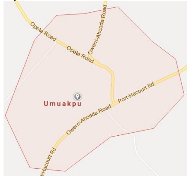
Figure 1 Google map location of the Musa Paradisiaca (plantain) plantation in Umuakpu in Imo state with a longitude of 5.255025 and a latitude of 6.876798

The data on the received signal strength intensity(RSSI) and base station information for the 3G network covering the plantation area were captured and logged using site survey android application, Netmonitor 1.5.84 installed on Infinix Zero 4. The 3G network signal frequency is 1800 GHz. The logged field measured datasets were later loaded into the computer where they are used for the path loss analysis.