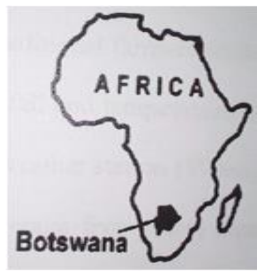
Figure 1. Location of study area in Africa

semi-arid characterized by hot and moist summers and dry mild winters. Rainfall is derived from convective processes and is highly variable even over small distances and averages 600 mm annually, thus making Pandamatenga one of Botswana's least arid areas. Almost all rain falls between October and April, with December, January and February being the peak months. A substantial proportion of this rain falls in short duration of high intensity storms, thus, leading to high run-on into some farms, which become flooded instantly. Maximum temperatures of 26°C to 34°C occur in October to March. Minimum temperatures of 11°C to 20°C are experienced between November and July. The vegetation is extensive grassland savannah in association with Mophane (Colophospermum mopane) and acacia species [12]. The Pandamatenga plains are underlain by basalt which occurs at the base of the black cotton soils. This basalt occurs subordinately with the sandstones. This basalt is mostly exposed around Pandamatenga village and extends eastwards across the border into Zimbabwe [12]. The area is dominated by vertisolic clay soils, which are potentially good farming soils. The soils are characterized by very high clay contents dominated by expanding lattice clay minerals which give them their and chemical properties. The area is physical generally flat with a gentle slope and rain water flows following natural drainage routes [2].