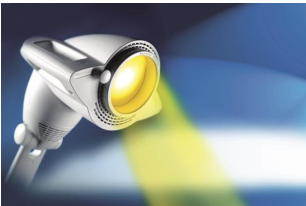
Fig. 2 light Therapy (PVIP). The device "BIOPTRON PRO" - 11cm.