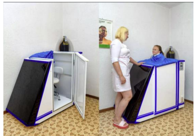
Fig. 4. Dry carbon dioxide baths using the "Reabox" device

Dry carbon dioxide baths (SUV) - a method of percutaneous therapeutic action of carbon dioxide on a patient whose body is located up to the neck level in a specially equipped box. Application (SUV) "Reabox" provides non-invasive, i.e. does not violate the integrity of the skin, the introduction of carbon dioxide, which distinguishes this method from CO 2 injections. Direct action of carbon dioxide on the respiratory center. The excitation of the respiratory center is not caused by carbonic acid itself, but by an increase in the concentration of hydrogen ions due to an increase in its content in the cells of the respiratory center.