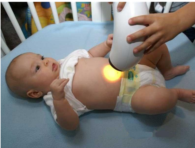
Fig. 1 light Therapy (PVIP) performed by the "BIOPTRON-COMPACT" device-5cm.

The most important function of this cytokine is to activate cellular immunity (the functional state of monocytes, macrophages, natural killers and cytotoxic T-lymphocytes), which primarily increases the body's antiviral and antitumor resistance.[13]