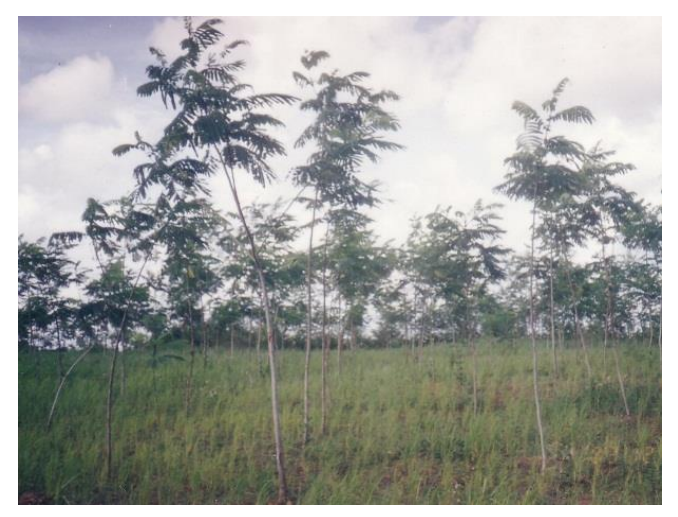
Figure 2. Paraserianthes falcataria mixed Oriza sativa in research plots of Kapuas District

Plots of plants combination system (t1) produced average yield of mount-paddy ( Oriza sativa ) of 3.05 ton ha<sup>-1</sup> in the first year. This paddy yield was better than the result of mount-paddy from local people using shifting cultivation that less environmental friendly which is just 0,5 to 1,3 ton ha<sup>-1</sup>.<sup>16</sup> The Paraserianthes falcataria canopy was wide and big which progressively caused decreasing of light intensity which was distributed on the forest floor<sup>23</sup> and could reduce photosynthetic quality and quantity and also decreased the paddy productivity.<sup>28</sup>