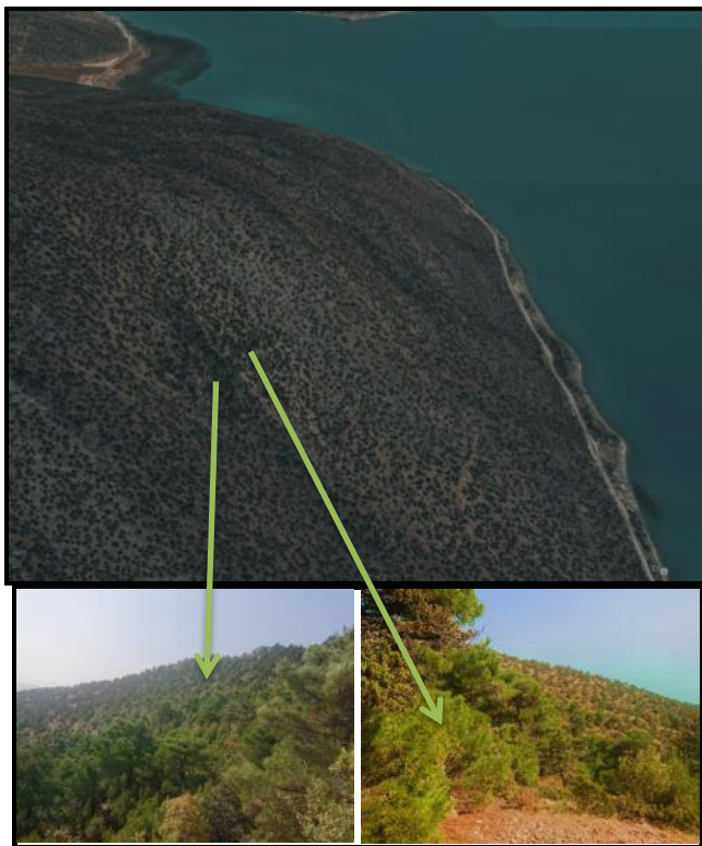
Fig. 2. General view of study area

The Turkish pine in the Yenişarbademli district was first identified by me in a field study in October 2016 (Figure 2). According to the literature survey, no study has been found about the Turkish pine is located in the Yenişarbademli region. In this research, the natural distribution area and site productivity (site index) of the Turkish pine in Yenişarbademli has been investigated. Thus, it is intended to make contribution to the information regarding the natural distribution of this species in Turkey. For this purpose, 9 sample plots, which are thought to have different site conditions, were determined. In order to determine the site productivity 3 tallest trees were identified in each sample area and their age and top height measurements were performed. After that all height measurements were indexed to the age of 100 years [7] and their averages were calculated. According to the obtained results, the site productivity was determined [8].