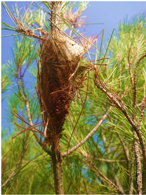
Fig. 4. Nests of the pine processionary moth

Besides, during the field surveys, some of the trees were suffered from "pine processionary moth ( Thaumetopoea pityocampa Schiff.)" (Figure 4).