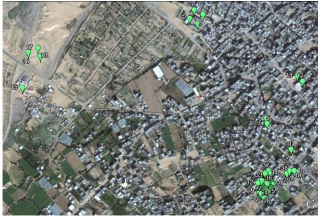
Fig. 3. Distribution of checkpoints.