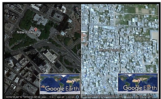
Fig. 1. Khan Younis and New York Cities from the same elevation in Google Earth.

In the Gaza Strip, Google Earth is widely used as a source of spatial data, especially after the recent war of 2014 in order to document and evaluate the damage of houses and other assets. Unfortunately, low resolution images are available for the occupied Palestinian territories on Google Earth. The clearest images of the Gaza Strip are blurred and unclear. On the other hand, high resolution images are available on Google Earth for other areas of the World that allow to zoom in and see more better details. Figure 1 shows images published on Google Earth in 2017 for Khan Younis City in the Gaza Strip and New York in USA. The images are at the same scale.