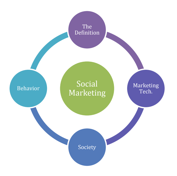
Figure 1: Social Marketing Definition and Factors

quickened development and change in its origination and structure. The development of social and societal progressions marketing is illustrative of the persevered [17]. The online person to person communication publicizing gadgets, for instance, interpersonal associations, wine club and societal showcasing techniques, can grow the learning of client's goals. The purpose of the article is to affirm whether these contraptions impact the thing change [11]. We have ended up being continuously convinced that there are essential request that require thought and talk inside the school of showcasing review our lifestyle as driving forces about the field of advancing [7]. To be named social showcasing, a program must apply business publicizing development, have the effect of willful direct as its primary concern, and on a very basic level attempt to profit individuals/families or the more broad society [18].