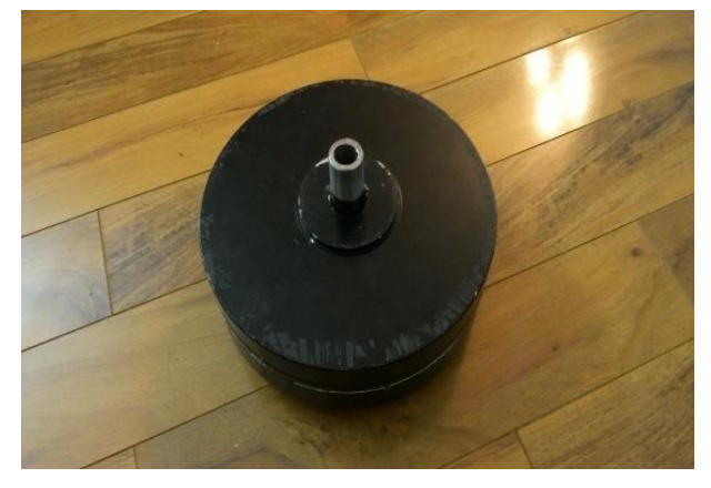
Fig-7 External View

DIFFERENCES BETWEEN CURRENT CORELESS GENERATOR AND OUR NEW DESIGN