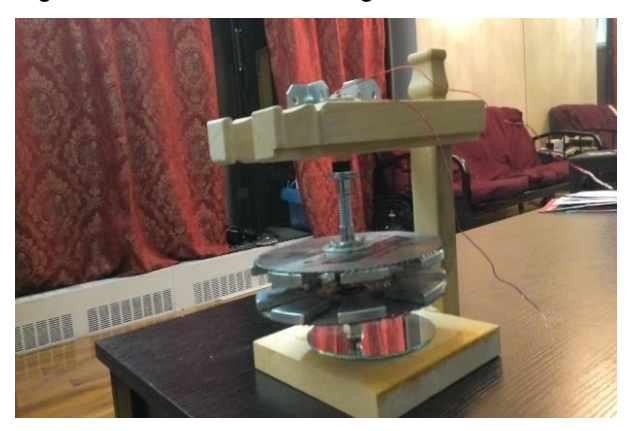
Fig 2 - Generator without stator coil