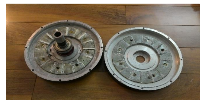
Fig-8 Internal view showing magnet slots on the rotor plates

In fig-8 and 9 rotor plates with the shaft and bearing are displayed while fig-10 is displaying the internal arrangement of coil and the shaft.