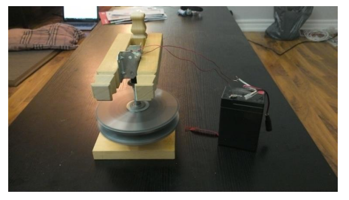
Fig 6 – Shows the current design as a demonstration.

Fig 5 – Shows working of coreless generators being used currently in markets. With battery input and AC output in volts (147.5).