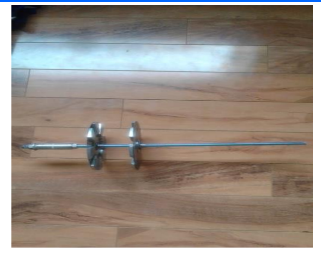
Fig 4 - Rotor plates and shaft assembly

THE DESIGN OF THE PRESENT DEVELOPED "SOLAR POWERED CORELESS GENERATOR"