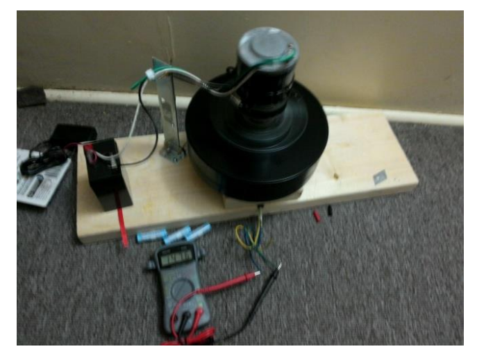
Fig 5 – Shows working of coreless generators being used currently in markets. With battery input and AC output in volts (147.5).

Demonstrative photo of the generators available in the market running with a DC input is given below and a demonstrative photo of the new working model.