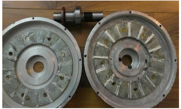
Fig-9 Rotor plates with the shaft and bearings

In fig-8 and 9 rotor plates with the shaft and bearing are displayed while fig-10 is displaying the internal arrangement of coil and the shaft.