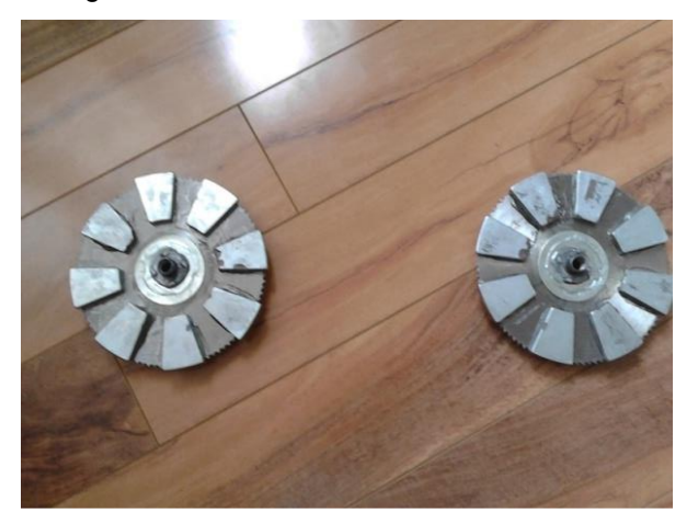
Fig 3 - Rotor plates