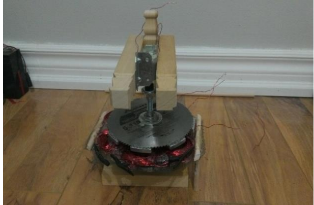
Fig 1 - Point friction coreless generator

Below is a working model demonstration of the setup without the solar panels