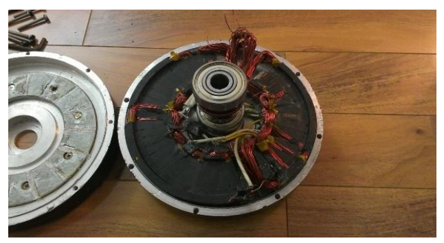
Fig-10 View of the coil and shaft