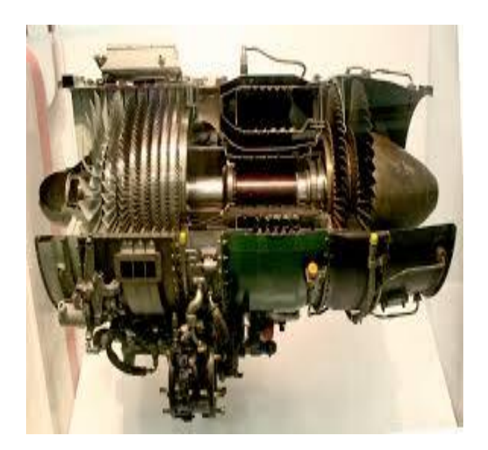
Fig 1.1 Gas turbine

turbine power plants are very compact and lightweight. The conventional steam power plant must occupy a far greater area and also much heavier.