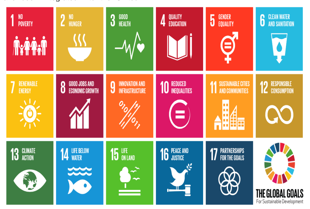
Figure 2: Sustainable Development Goals charter [12].

Figure 2 presents charter of the SDGs which seeks to address global issues of poverty, Food, Health, Environment, Gender equality, Women, Water, Economy, Infrastructure. Habitation. Energy, ecosystems, Consumption, Climate. Marine Ecosystems, Institutions, and Sustainability [10]. Based on the ratified resolution, the United Nations (UN) has organised an integrated programme to support progress in the realization of the goals crucial to sustainable development around the globe [10-12]. As part of the objectives of this paper, the nexus between the SDGs and Indonesia's cultural heritage will be examined as a yardstick for socioeconomic growth and sustainable development.