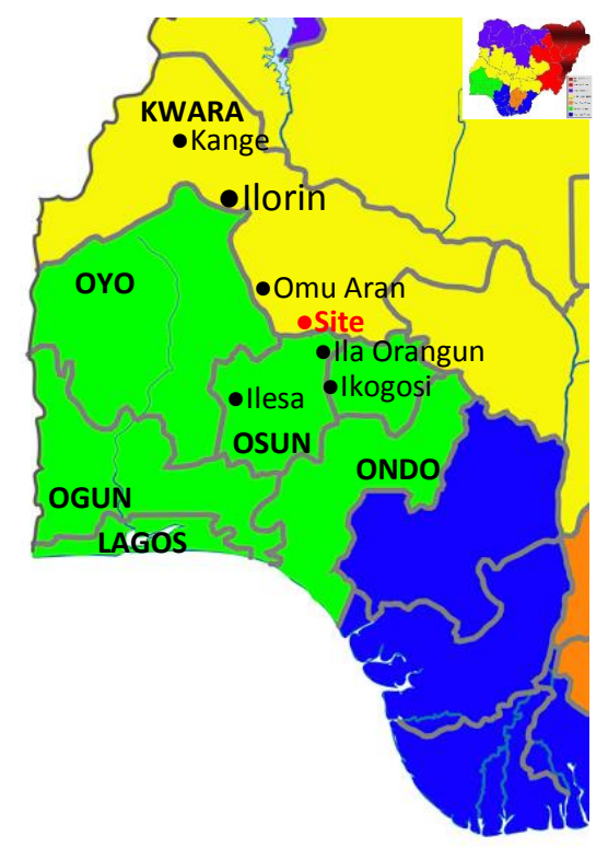
Figure 1: Map of Nigeria, showing the south western states in relation to the site of seepage

Collation of available data from memorabilia led to site investigation and interaction with key community leaders in the area (Figure 1) where oil and natural gas seepage had occurred.