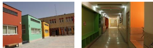
External spaces Corridors Figure 4: Spaces of Haghpanah School

Haghpanah School analysis is performed as the following: