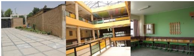
External spaces Corridors Classroom Figure 3: Spaces of Hossayn Amin School