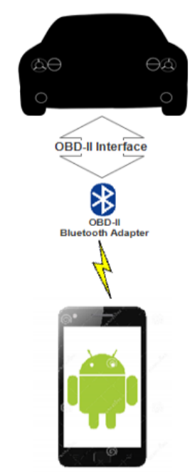
Fig. 1. Android-based OBD-II System

The Android-based application reads data from a vehicle's ECU by connecting to the ECU via a Bluetooth-enabled adapter. See Fig. 1 for the application illustration of the diagnostic system.