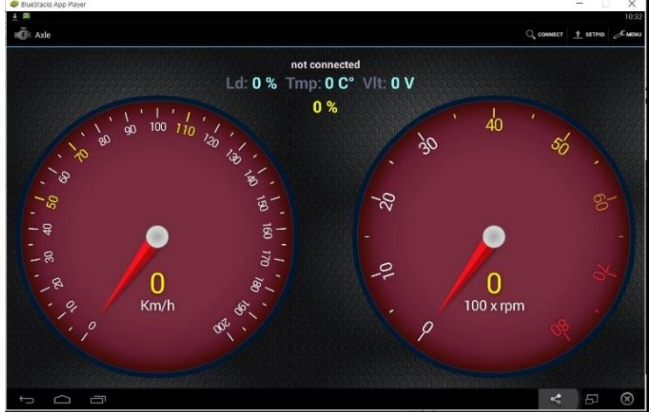
Fig. 4. The ABVDS application user interface

The Engine Load function displayed variation as expected when tested with 2012 Hyundai Accent but when tested with the 2000 Lexus RX300, the Engine Load function displayed 0%. Also, the battery voltage remained constant throughout at 0 V for both two vehicles. This was due to the vehicle torque application compatibility with the ELM327 adapter used for the project.