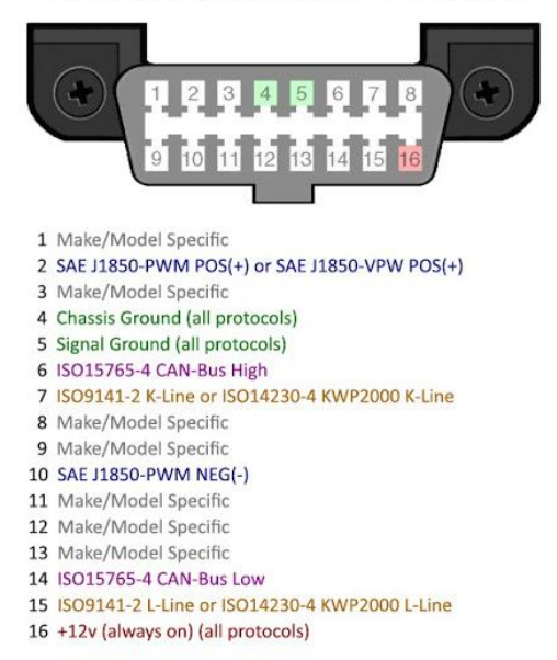
Fig. 2. Data Link Connector (SAE J1962)