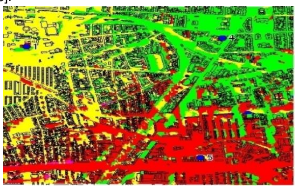
Figure 1: Base station transmitter C. Satellite Technologies

signal due to phenomena such as mean propagation loss, slow fading and fast fading. The mean propagation loss comes from square-law spreading, absorption by water and foliage and the effect of ground reflections. Mean propagation loss is range dependent and changes very slowly even for fast mobiles. Slow fading results from a blocking effect by buildings and natural features and is also known as long-term fading, or shadowing. Fast fading results from multi-path scattering in the vicinity of the mobile. It is also known as short-term fading or Rayleigh fading, for reasons explained below. Multipath propagation results in the spreading of the signal in different dimensions. Figure 1 shows the results of the base station transmission and the effect of streets and the impact of the building on the propagation. The different colors in the pictures represent the coverage area of three base stations (shown as blue dots with a number next to them). The yellow color represents the area where the signal arriving from station 1 is strongest, green is from station 4 and red for station 5. Stations 2 and 3 are not shown in the picture, still there are some points where their signal is strongest and can be seen colored in pink or blue [6].