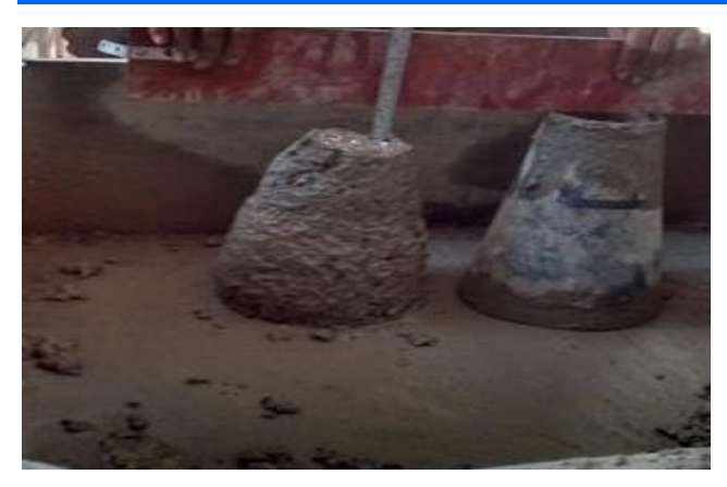
Fig.1 Workability measured by slump test