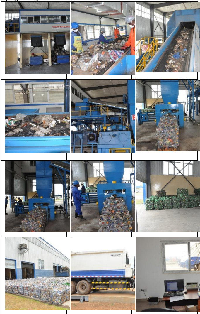
Figure 4: The photographs below depicts the existing facilities of Zoomlion Ghana Limited to supply raw materials for companies to process.

Department and Agencies (MDAs) of the central government, metropolitan, municipal and district Assembly (MMDAs) or local Authorities, and the communities they provide services. Zoomlion also operates in other African countries such as Togo, Angola and Guinea, while negotiations are far advanced for the company to start operations in Nigeria, Sierra Leone and Liberia. In its vision to pursue excellence in the industry, the Zoomlion Ghana Limited has the willingness to exchange ideas with international waste management companies. The photographs below depicts the existing facilities of Zoomlion Ghana Limited to supply raw materials for companies to process, and especially for export (Figure 4)