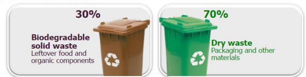
Figure 3: separation of solid waste into two streams at disposal points