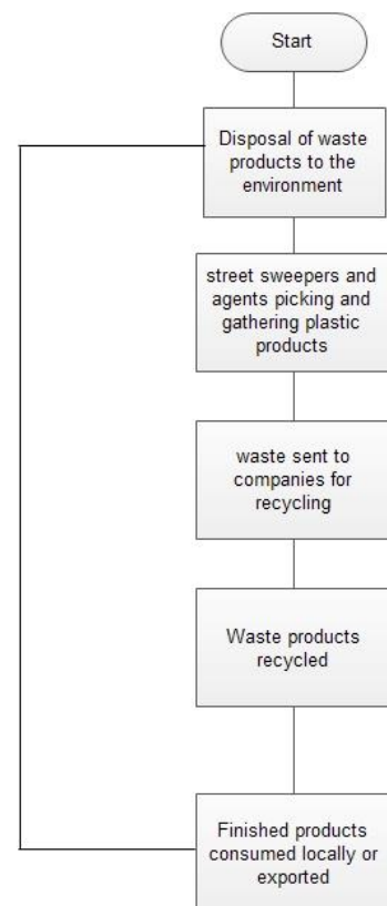
Figure 3 illustrates the channel of empty PET bottle disposal and collection in Ghana. In this regard, people are engaged in the collection of plastic bottles from various sources mainly to reuse them for other purposes. Some of the people scavenge the neighborhoods for the empty plastic bottles, while other street sweepers also supply plastic bottles to 'Qualiba' men. From our observations, we noticed that the plastic bottles are mainly sold at local markets; thus for packaging both local drinks and oil for retail businesses.