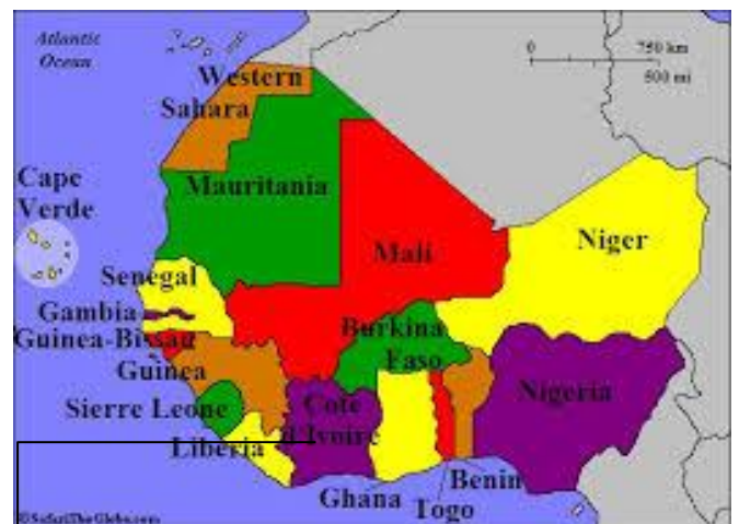
Map of West Africa