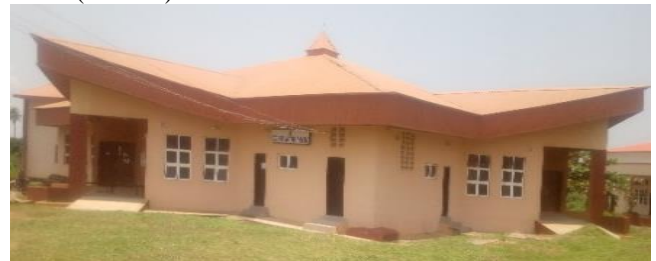
Figure 3: 1000 Capacity LT

The number of measuring point corresponds to room index value (Table 4).