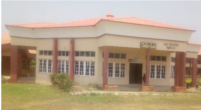
Figure 5 :3-In-1-A LT

Two different lux meters were used to measure the lux level of the study area at regular interval during the day. The measurements were taken under different condition of the day -morning (8-9 am), afternoon (12-1 pm) and evening (5-6pm) in the month of August, 2020, due to the usage of the lecture theatres.