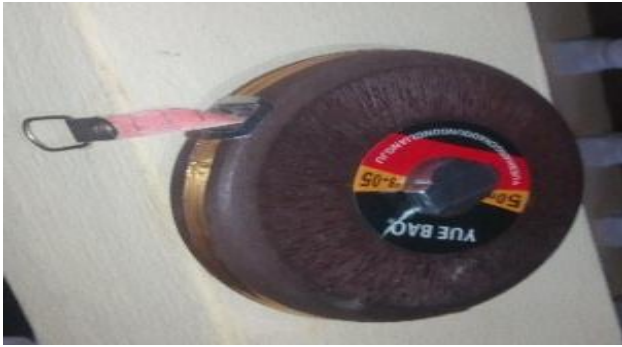
Figure 1: Measuring Tape