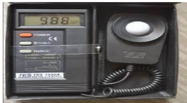
Figure 2: TES 1332A Lux Meter