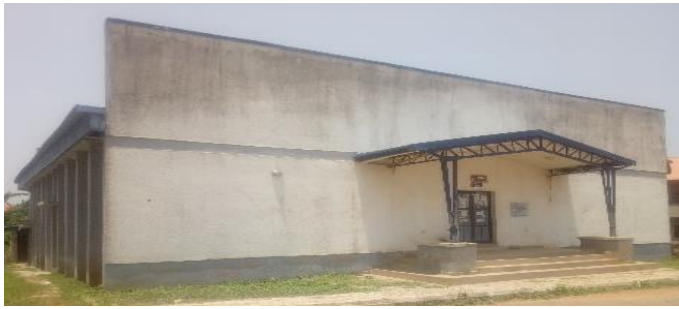
Figure 4: FBN LT