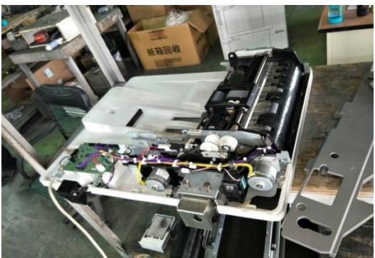
Fig.8 The switch that has been inspected