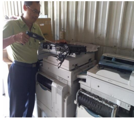
Fig.3 The inspection of the operation panel and switch