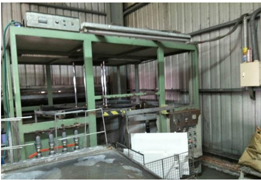
Fig.7 The operation panel that has been inspected