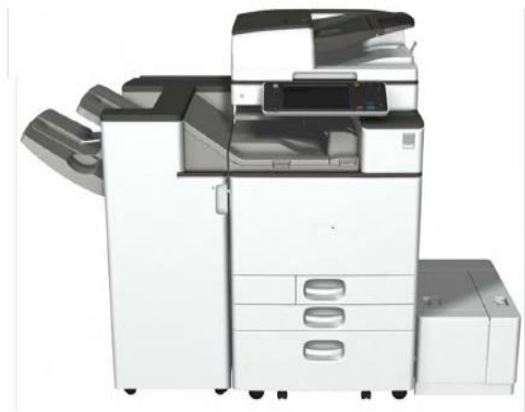
Fig.1 The appearance of a business machine [1]