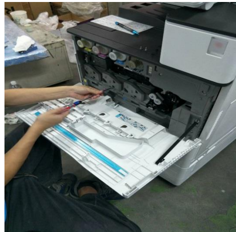
Fig.4 The testing of the operation panel and switch