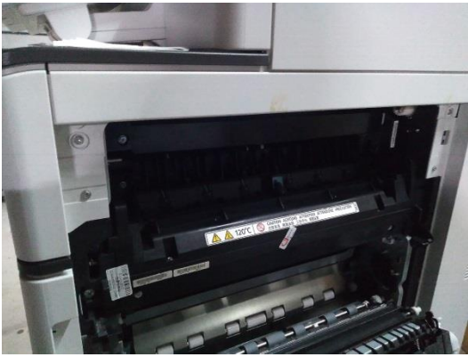
Fig.6 The troubleshooting of the switch