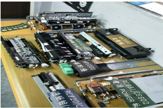
Fig.5 The paper exit cooling fan that has been repaired