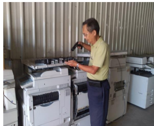
Fig.3 The inspection of the air circulation system