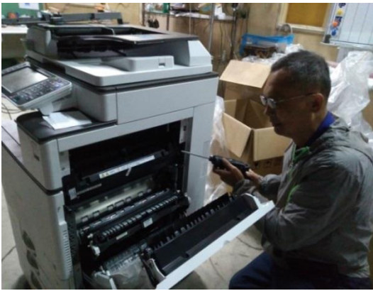
Fig.4 The testing of the air circulation system