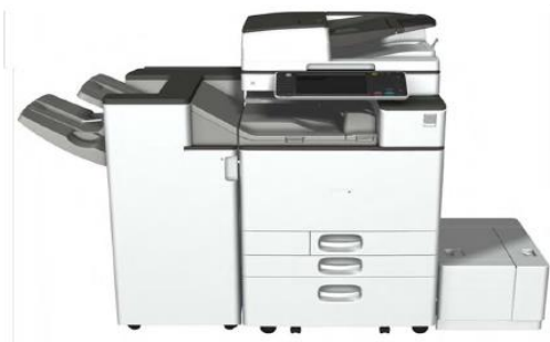
Fig.1 The appearance of a business machine