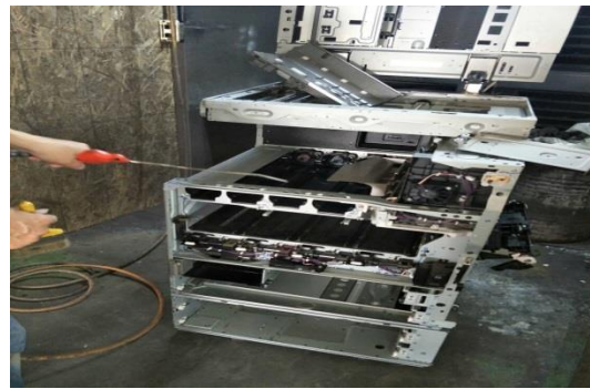
Fig.7 The fusing exhaust heat fan that has been repaired