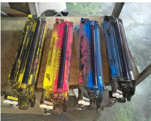
Fig.6 The power supply unit cooling fan that has been repaired