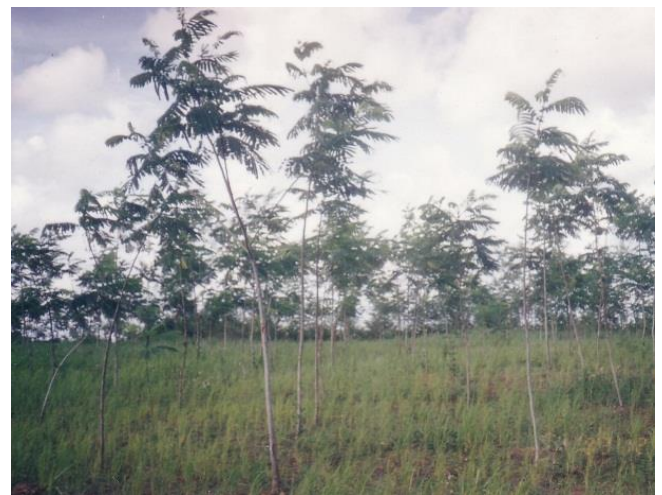
Figure 2. Paraserianthes falcataria mixed Oriza sativa in research plots of Kapuas District

Plots of plants combination system (t1) produced average yield of mount-paddy ( Oriza sativa ) of 3.05 \text{ ton ha}^{-1} in the first year. This paddy yield was better than the result of mount-paddy from local people using shifting cultivation that less environmental friendly which is just 0,5 to 1,3 \text{ ton ha}^{-1} . 16 The Paraserianthes falcataria canopy was wide and big which progressively caused decreasing of light intensity which was distributed on the forest floor 23 and could reduce photosynthetic quality and quantity and also decreased the paddy productivity. 28