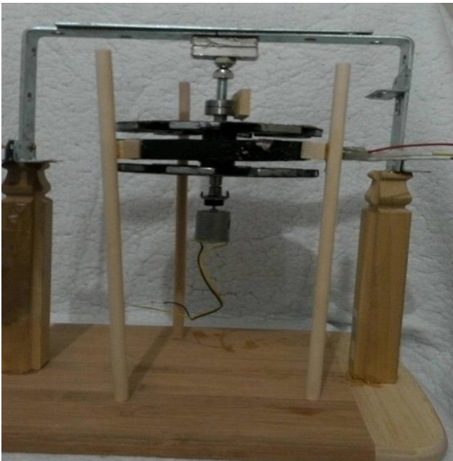
Fig-2 Constructed Model (Front view)