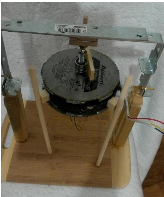
Fig-3 Top view