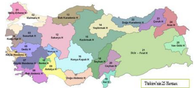
Figure 1. Turkey water basin map