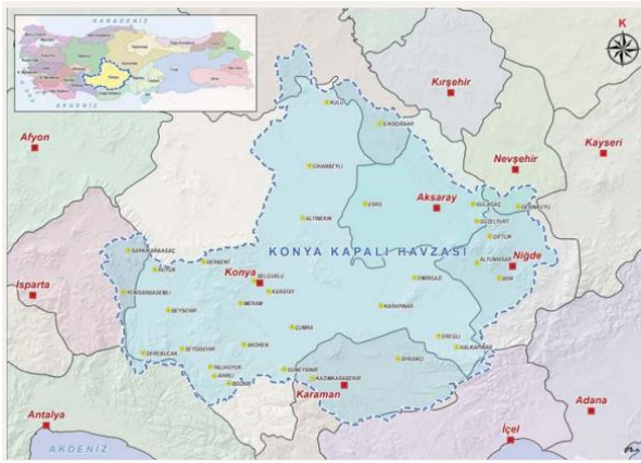
Figure 2. Konya closed basin map.

Over the past 50 years, rivers and underground waters that feed natural water resources have been directed to artificial wetlands such as dams, ponds and storage that serve human use for agriculture or agricultural irrigation. As a result of these interventions, all natural wetlands outside the regulated Beyşehir Lake, Kozanlı - Gököl and Iğın-Çavuşçu Lake are completely dried or shrunk to a great extent [6]. Although the insufficient surface water resources, the basin has a significant underground water potential, and the underground waters of the basin used today are formed in cool and humid climatic conditions in the geological past [12].