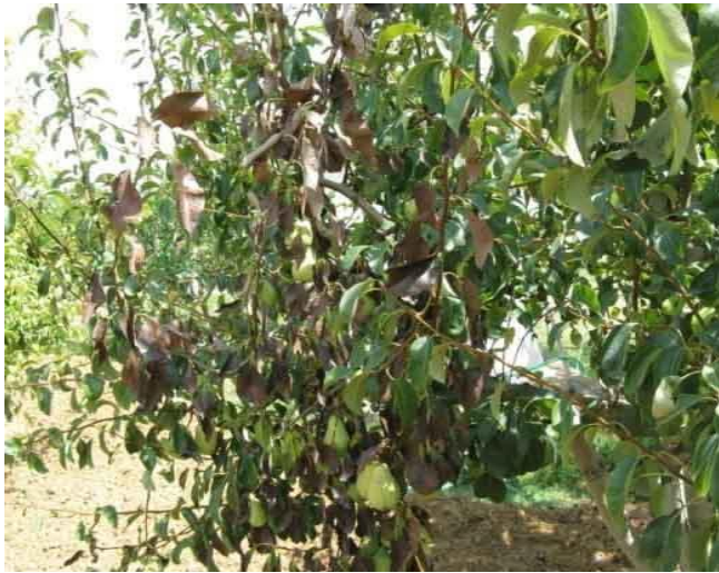
Fig 3: Fire blight on Zhurje