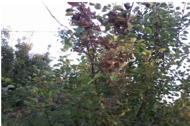
Fig 4: Fire blight on Laknas