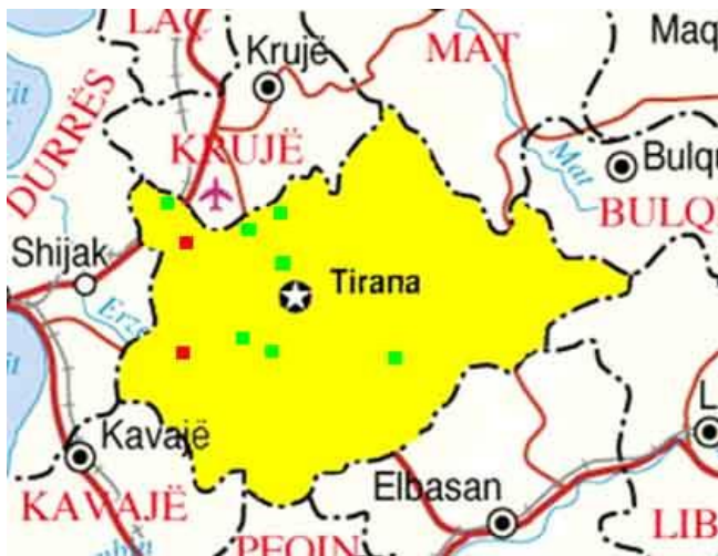
Fig. 1. ■ (Pezë Helmës, Ndroq, Qinam, Sauk, Tapizë, Bathore, Laprakeë (No infection); ■ Zhurie, Laknas (With infection). Monitoring results in the district of Tirana for the 2015 year.

Monitoring results in the district of Tirana for the 2015 year are presented in the figure 1.