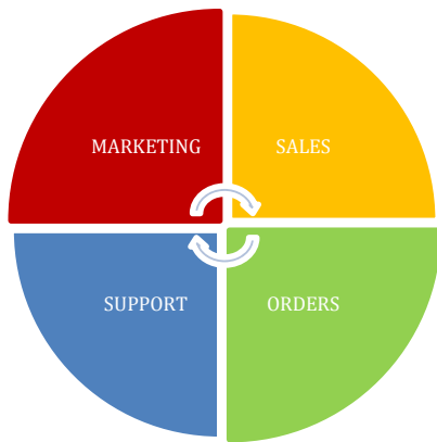
Figure 4: Above cycle shows the flow of CRM.