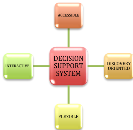
Figure 2: Characteristics of Decision Support System

Decision support system refers to the area of management information systems which completely helps in decision-making. It excludes manufactured decision systems which essentially brings the proper decisions for management approval - e.g., many inventory-control and billing systems [16]. A DSS for organizing marketing policies and assigning resources for retailers is explained. This decision support system consist of model which builds and analyzes methodology [17]. In last ten years we have observed the development of systems that are computer-based that support groups of people in various tasks, including limited decision making. [18]. The decision support system helps in decision making of operations, financial management of a company that includes building strategies. Decision support system can be a model driven, data driven, communication driven, document driven as well as knowledge driven [19].