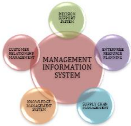
Figure 1: Management Information System and its types.