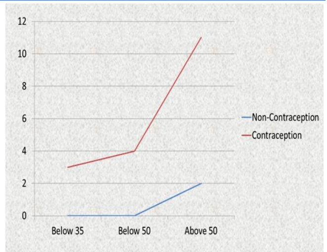
Figure 2 Cumulative distribution of Mortality across age.